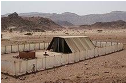
Model of the tabernacle in Israel

NATIVE STARS will build on the tribal lands of El Mirage campus in San Bernardino the exact replica of the Tabernacle. The terrain of El Mirage looks identical to the terrain of the Sinai desert.